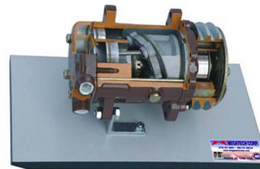
MEGART 10651: Axial Alternative Compressor w/ Simple Effect Piston