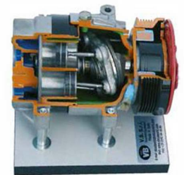
MEGART 10652: Axial Alternative Compressor w/ Variable Displacement