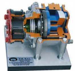
MEGART 10654: Rotary Scroll Compressor