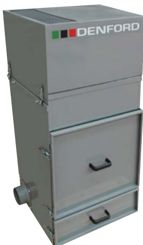
High volume floor standing dust extraction unit. (Requires single phase, 16A supply protected by either a fuse or an MCB C Type)

The Denford Vertical Router is a large format CNC Router, combining high speed machining over a large working area with space saving engineering. The 1200 x 800 mm working envelope makes it ideal for the manufacture of large-scale items such as furniture parts and door panels. The machine is well equipped with a high power 21,000 rpm spindle motor and AC Servo Motors allowing contouring and rapid feeds of 20 metres per minute in all axes. Inspired design provides excellent production capabilities and ease of installation, as the Vertical Router will fit through a standard door frame.