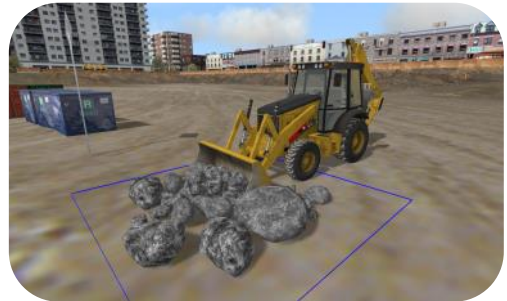
Dumping material on dumping zone with loader bucket