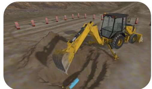
Exposing a buried utility with the backhoe bucket