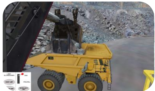
Positioning under full-load conditions for dumping into a Mining Truck