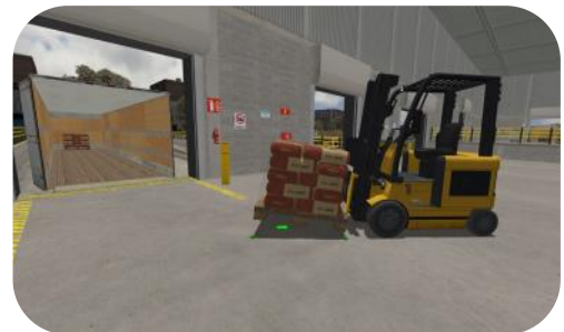
Placing loads into a box truck at the loading dock