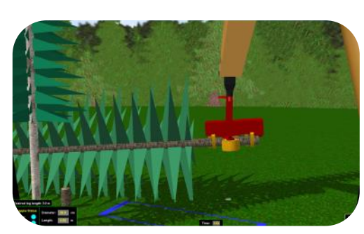
Mastering the basics of the complete Cut-To-Length cycle