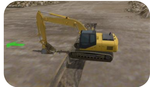
Trench Crossing using Boom Jacking