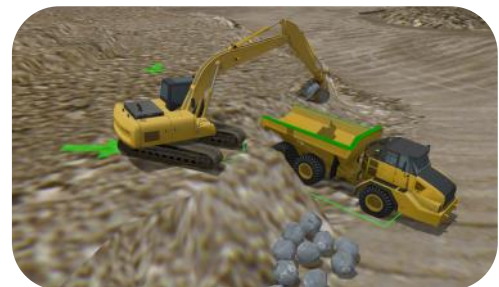
Truck spotting with an interactive, articulated dump truck