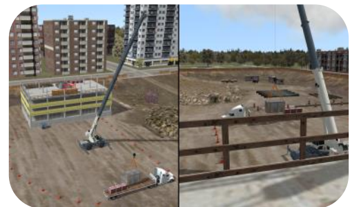
Signal Person Views

A fixed view of the lift area, with the crane, load and target visible. A dynamic view that follows the movement of the load.